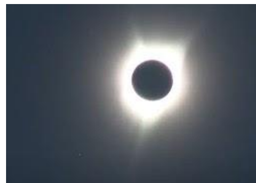
The 2017 Great American Eclipse.

Hams across North America are asked to participate in a study about how the ionosphere functions by getting on the air to help scientists in a series of ionospheric experiments.