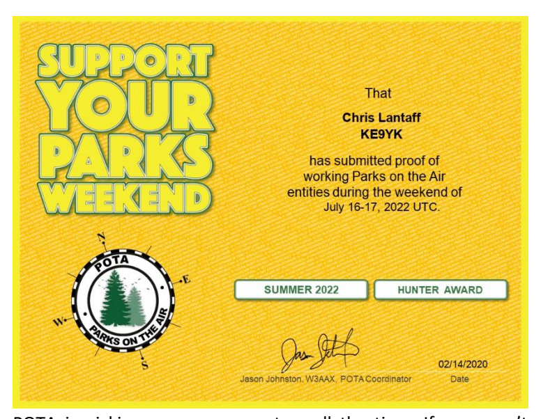
POTA is picking up more operators all the time. If you aren't activating there are all kind of opportunities to be a hunter!

Do you have something you would like to submit for the Brag Rag? Send your QSLs, special event certificates, awards, interesting photos, projects etc. to <a href="mailto:sparks.w9og@gmail.com">sparks.w9og@gmail.com</a> to have them included in your newsletter.