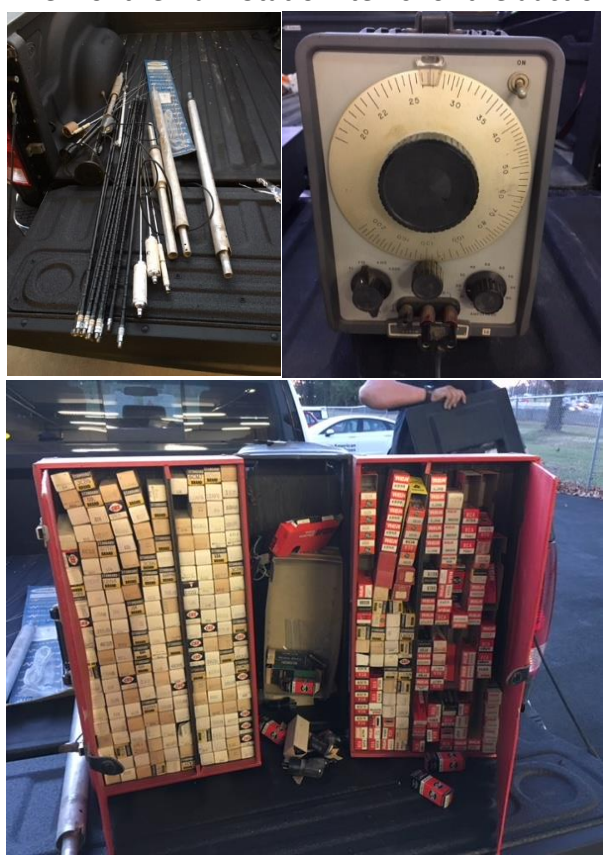
Join us at the auction to see the rest......

A few of the Ham Station items for the auction.