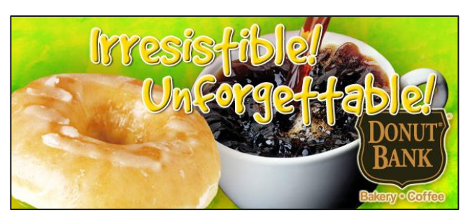
Thank You to Donut Bank for furnishing donuts at the December TARS meeting.