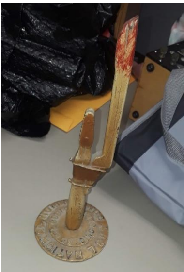
ROYAL ORDER OF THE WOUFF HONG AWARD SEPTEMBER 1938 NATIONAL CONVENTION CHICAGO

Many of the younger members probably don't know just what the Wouff-Hong is or represents.