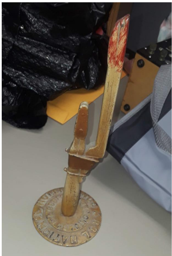
An ARRL WOUFF-HONG from the 1938 Chicago Convention