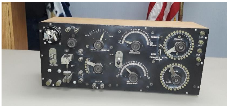
A CN 113 WWI receiver in excellent condition