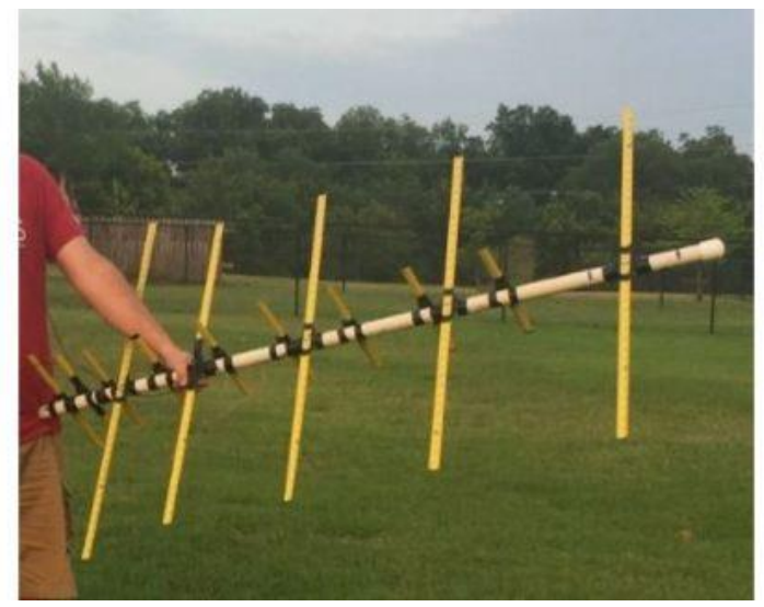
Here's a look at an antenna made with these parts:

The element holders are attached to the boom with electrical tape in the photo above. While I haven't tried it, I'd suggest that the antenna might be a bit more robust if you could screw or perhaps glue the holders to the boom.