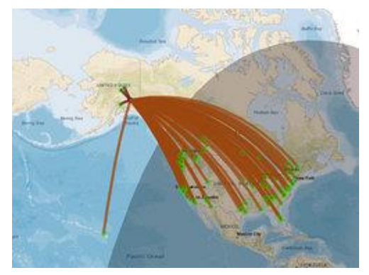
The HAARP WSPR spots map.

the 40- and 80-meter bands, with a 2-minute off period between transmissions." He said HAARP transmitted in full-carrier, double-sideband AM because it does not have SSB capability. HAARP operated under its Part 5 Experimental license, WI2XFX, with Special Temporary Authority (STA) from