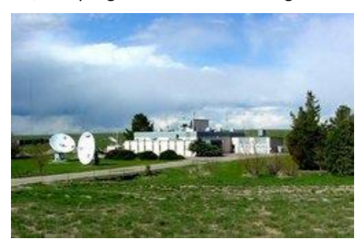
The WWV campus in Fort Collins, Colorado.

NIST said that it plans to eliminate "efforts that have been replaced by newer technologies, measurement science research that lies outside NIST's core mission space, and programs that can no longer be